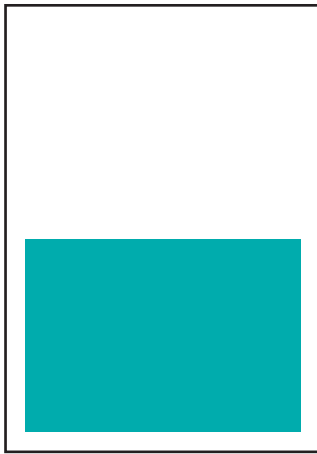
1/2 Page 182 wide x 127 high No Bleed